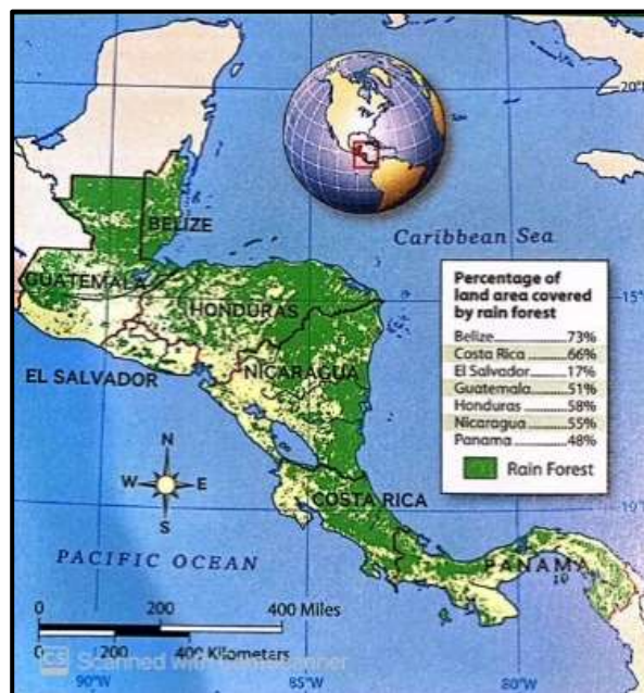
Figure 3: Percentage of Land Area Covered by Rain Forest.