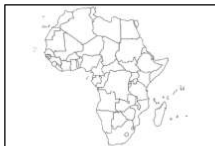
Figure 2: Map of the "Mother Continent".

Based on figure 2 , answer the following questions: